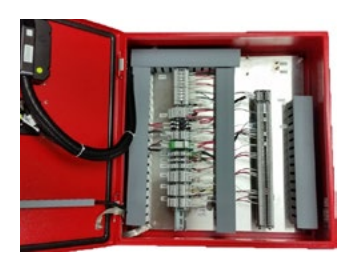
VRU Pro with EICS Option